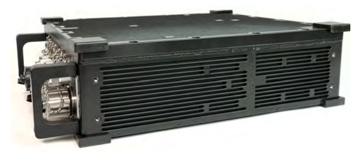
Figure 4: mounting holes on each side