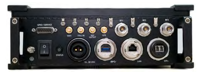
Figure 3: Interfaces of the IZT R5071

Alternatively the IZT R5071 enables signal processing without an attached Sensor Controller PC. Triggered recordings of measurement tasks allow for autonomous operation of the equipment for later offline analysis.